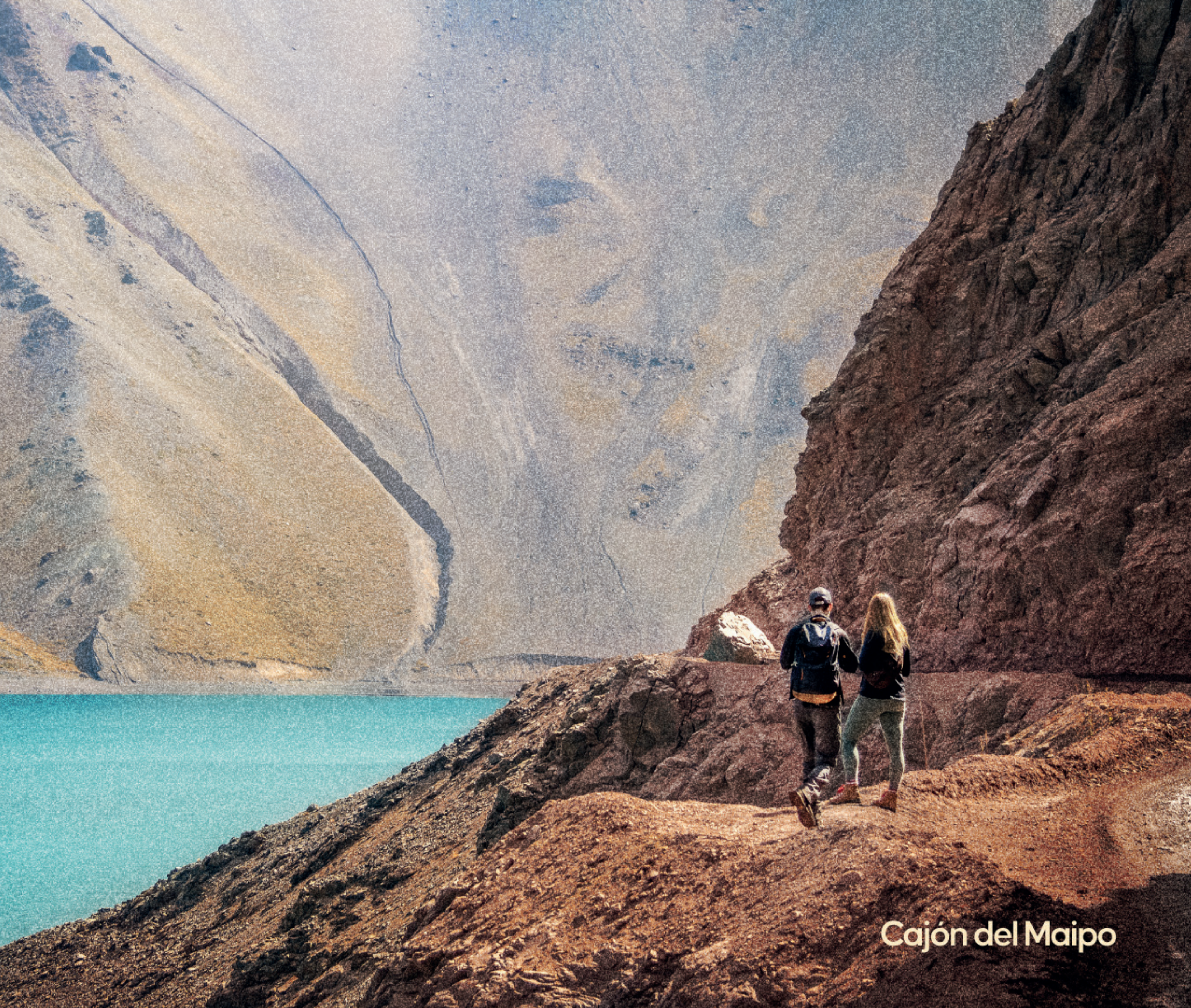
Cajón del Maipo